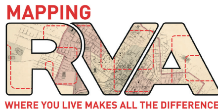
Where You Live Makes All The Difference: An Opportunity Map of the Richmond Region